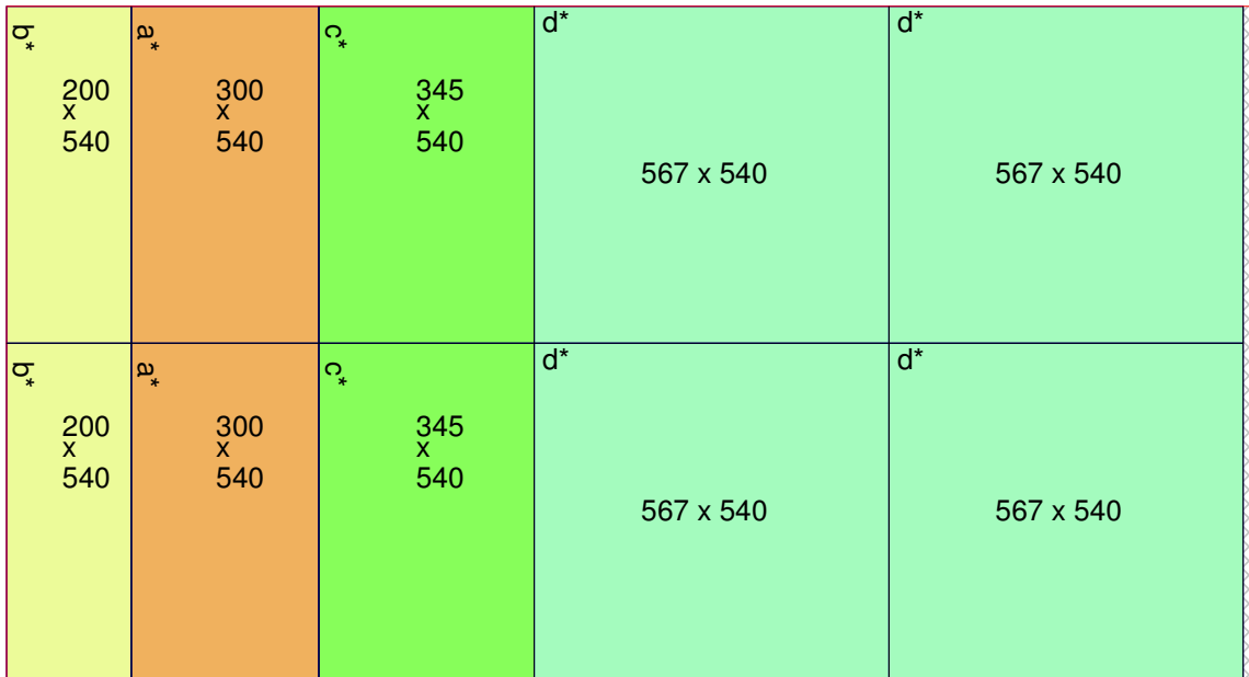
Layout 4 of 6(Stock:b Dim:2000 x 1080 Qty:1)